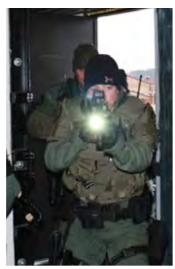
Law enforcement personnel clear a room at our High Risk Entry Facility (HREF) which provided them with valuable training.

state-of-the-art in-scope simulation, LRPSS enables the designated marksman to accurately and effectively engage human avatars or other targets.