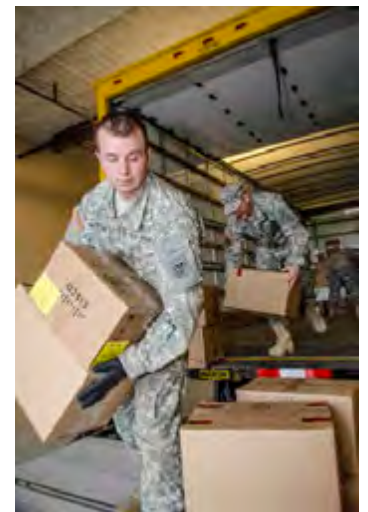
DCP member assists the DEA in disposing of pharmaceutical drugs during their Take Back initiative.

ment Administration (DEA) this year in their national "Take Back" initiative to collect and dispose of potentially dangerous pharmaceutical drugs. This initiative collected more than 27 tons of unused, unwanted and expired pharmaceuticals in Wisconsin. The campaign also focused on the misuse of pharmaceutical drugs as well as keeping them out of the water system.