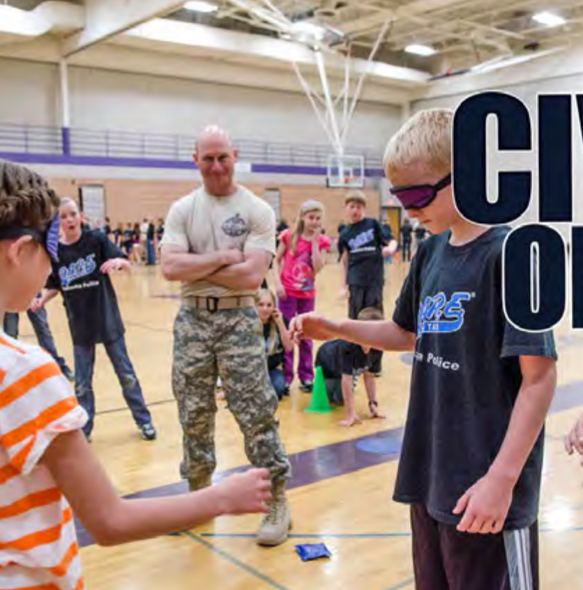
Facilitators educate youth about the dangers of drugs through fun events.

“Back at school, the students might not remember who fell in the water or who helped lift them over a wall. But they will remember how it felt to work together as a team to accomplish something that would have been impossible alone.”