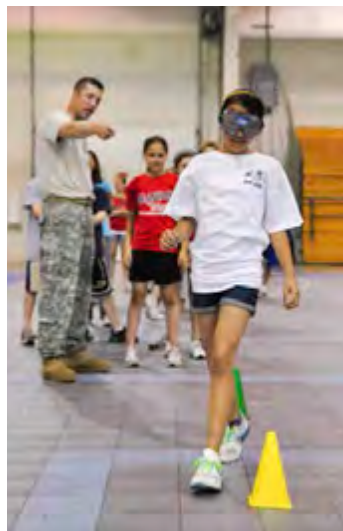
A student attempts to navigate an obstacle with goggles that simulate the affects of alcohol.

Our Civil Operations mission will provide a strong response to substance abuse in each community by building effective local coalitions and supporting their implementation of evidence-based strategies. Coalitions are strategically poised to develop a holistic and effective response to local drug problems. Our Guardsmen will play a critical role in fostering an effective community response by using unique military skill-sets and culture to assist local coalitions in addressing substance use/abuse. We will also be able to effectively measure the coalitions effectiveness by providing feedback using the “Kaizen,” which measures a coalition’s ability to implement the essential processes, Strategic Prevention Framework and helps community partnerships continuously improve their work.